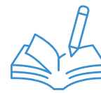
PROCESS DESIGN & DOCUMENTATION