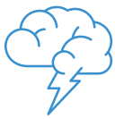
BRAINSTORMING & IDEATION

MindManager empowers team members to be more productive on their own, work better with each other, and maximize the tools available to them. It's an industry leader in the world of mind mapping, interactive diagramming, strategic business planning, task and project management, and more.